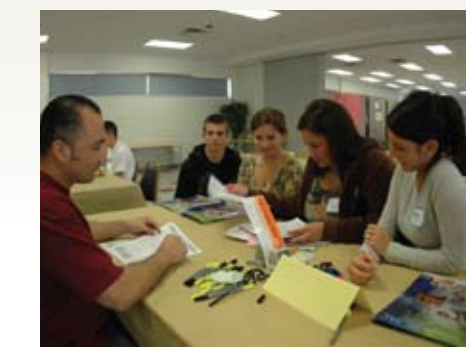
Financial Aid Workshop

The Financial Aid Office provides information and assists students in applying for financial assistance in the form of grants, loans, scholarships, enrollment fee waivers, and work study opportunities. The Board of Governors Fee Waiver (BOGW) is a state program that waives the enrollment fees for eligible students. You may apply for