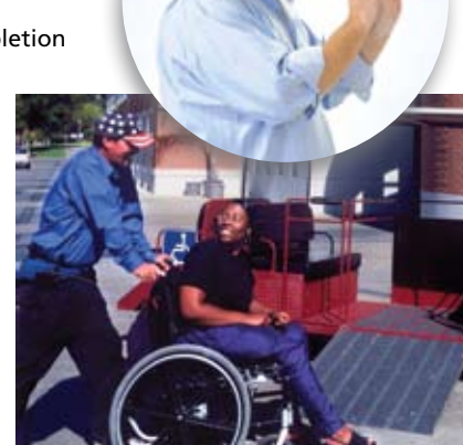
Sign language and transportation services

Some students mistakenly think that this office only serves those with obvious physical disabilities. Actually there are many students who struggle with learning challenges