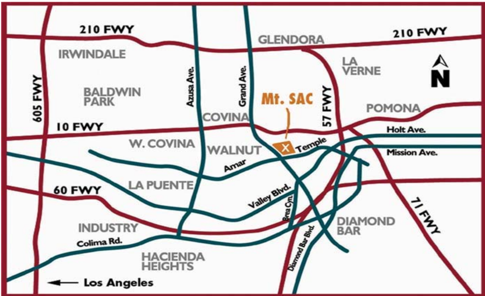
Exhibit 1 REGIONAL LOCATION