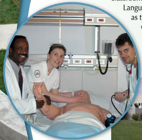
Language Center, Student Health & Resource Center and Health Careers Center complex