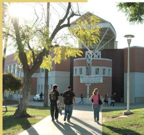
Student Services Center