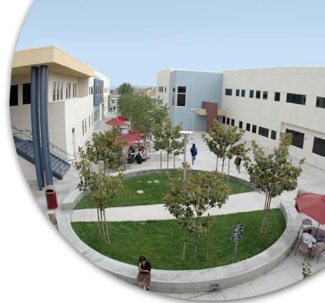
Promise of New Facilities

A burgeoning student enrollment growth placed further strain on Mt. SAC's already taxed facilities, which compromised the College's ability to fully live up to its open-access admission policy. Forecasts projected the need to turn away more than 5,000 students over the next five years unless effective