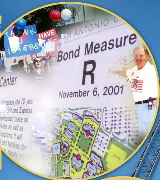
Promise to Voters