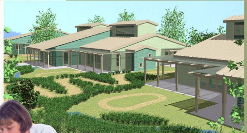
Rendering of proposed Child Development Center