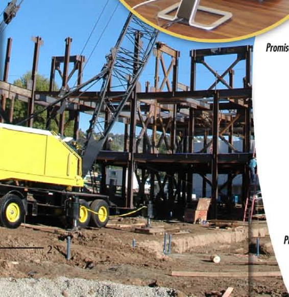
Promise of Quality Construction