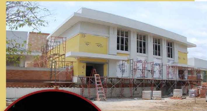
Music Building Expansion