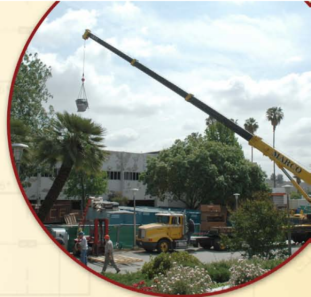
Natural Science Building (7) renovation

See partial list of additional master plan projects on the next page which must be funded by future bond, State and other resources.