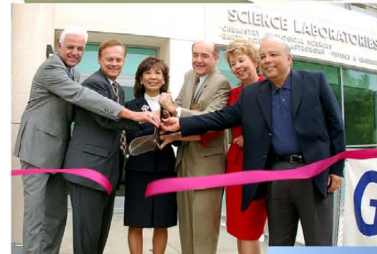
Mt. SAC President and Trustees officially opened new Science Laboratories Building on November 3, 2006.