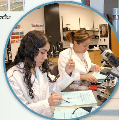
Science Laboratories Building

Completed: 2003 Cost: $1.2M Architect: KTG Group