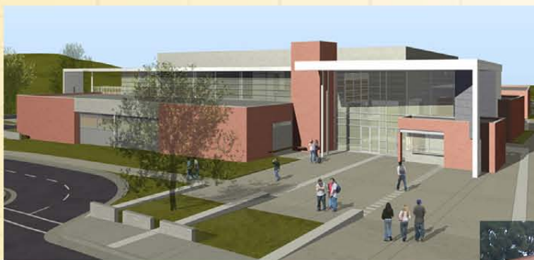
New gym is needed to replace outdated original facility built in 1950.