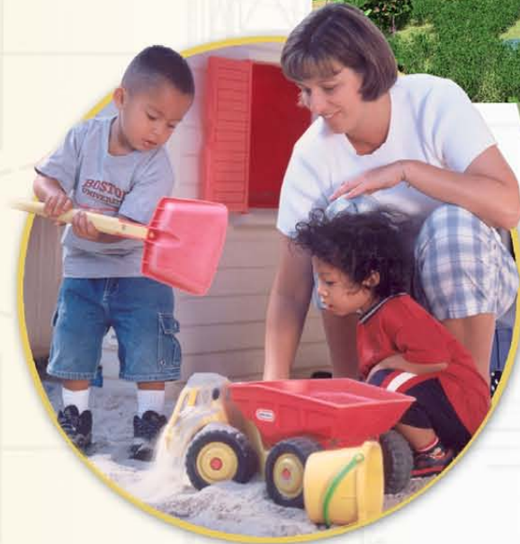
New center would improve child care services provided to student-parents and the community.