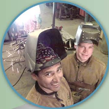
Welding & Air Conditioning Complex

Completed: 2005 Cost: $5.6 million Architect: GPRA