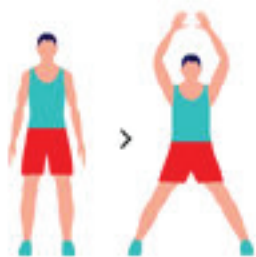
1. Jumping Jacks