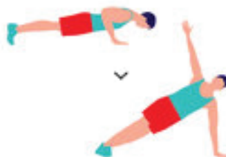
11. Push-up & rotation