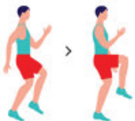
9. High knees running in place