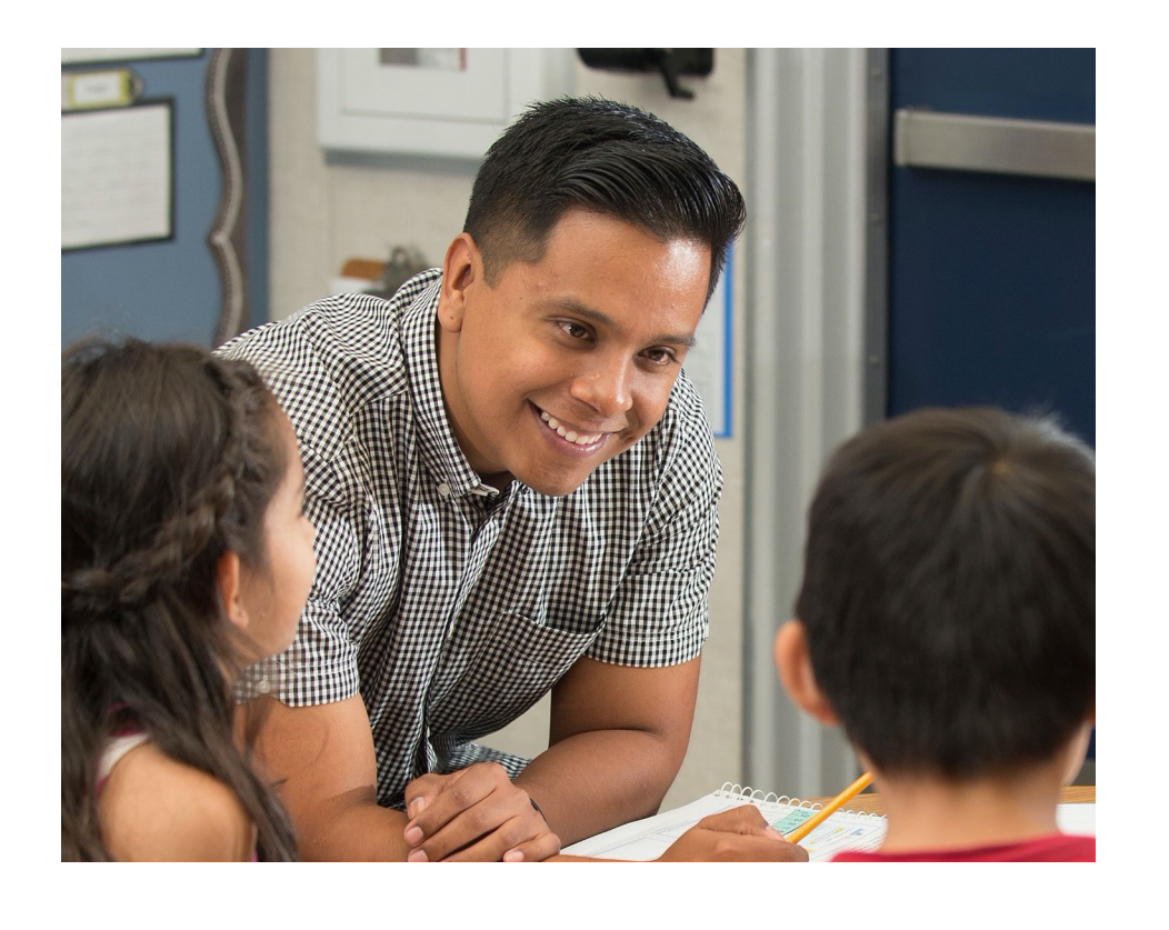
Teacher Credential Programs Education Department College of Education & Integrative Studies