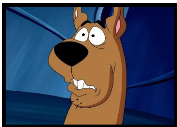
Scooby está confundido. (Temporary State)