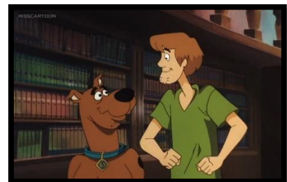
Shaggy y Scooby están listos. (Temporary State)